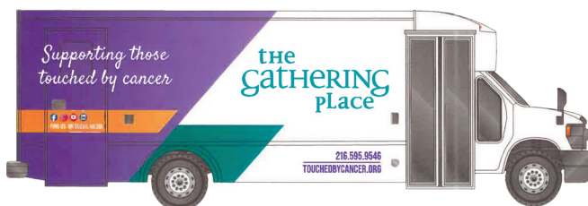
TGP's Beachwood wig salon and a rendering of TGP's new mobile vehicle, designed to offer on-the-go services.

to transportation or weakened health – are now able to participate online. We want to meet people where they are."